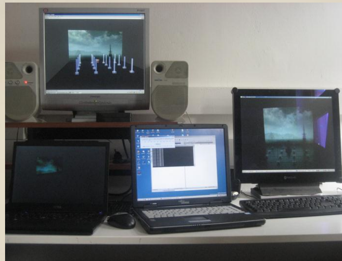
Figure 3 | CIANT Artistic Testbed – Virtualisation of Hallerstein using the Performance Viewer Tool.

Yet, this approach is not without its challenges. The main difficulty faced was that not all the assets were available. For example, the DMX lighting data was either not recorded, or was not obtained from the lighting technician. Additionally, the various digital files created by numerous individuals involved in the Hallerstein production meant that files were typically stored on many different (often personal) computers, increasing the chance of files being misplaced. As is typical with these projects, there is rarely funding available to support the post-performance documentation and wrap up. For conscientious individuals, some would go to the effort of sorting and handing over various assets (without being paid to undertake this work), which is more often than not, quite time consuming. In addition, in undertaking this kind of in-depth documentation, which requires the actual 'working files', there is